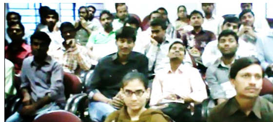
Participating Students & Research Scholars