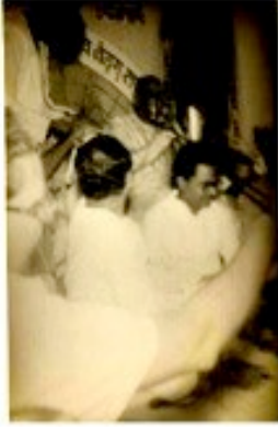
World Telugu Conference