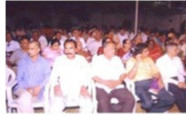
Section of the Audience

The steps taken by Samithi resulted in the publication of the articles highlighting the eminence of the Maha Kavi and presentation of programmes in the electronic media also contributed immensely. Following is the list of some of the programmes.