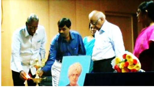
Inauguration: Prof.Elluri Siva Reddy lighting the lamp