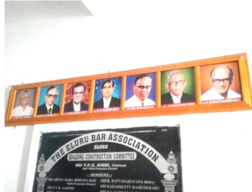
Photos of the legal luminaries adorning the Hall of Fame in the Eluru Bar Association